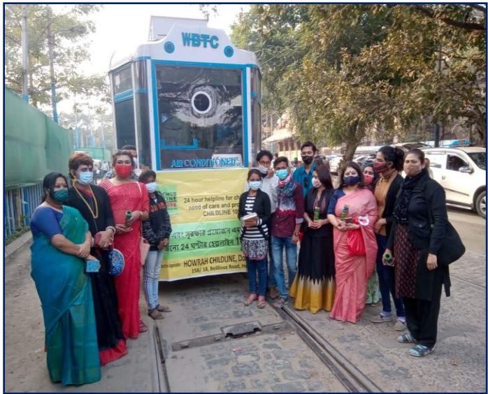
Childline Awareness Program in Kolkata