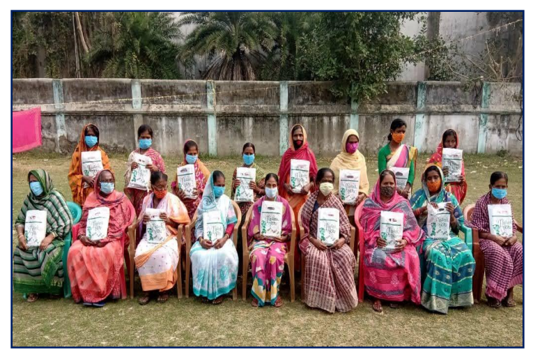
Saris distributed to women in ASSP Centre in Uluberia slum area