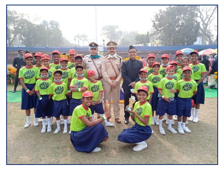
Kalyani Children secured third position in the District Parade Competition