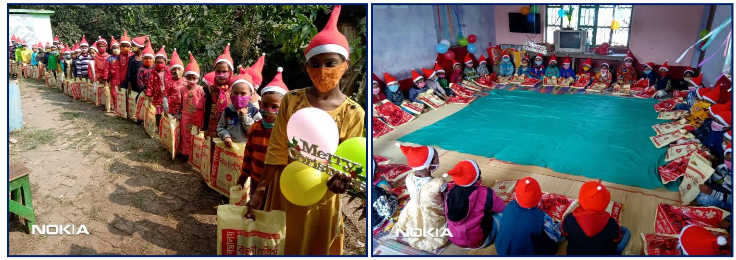
New clothes for children in ASSP's Premchand and Chengail centrres

Christmas celebrations were muted this year due to Covid restrictions. The boys and girls designed the crib and partook of the special Christmas lunch and dinner in their respective hostels, there were no programs. The Past Pupils Meet was cancelled to avoid a large gathering, the size of the get together usually exceeds a thousand during the Past Pupils Meet and would have been extremely difficult to enforce social distancing norms with a such a large group. DBA children received new clothes and so did children in Howrah station and our ASSP Centres.