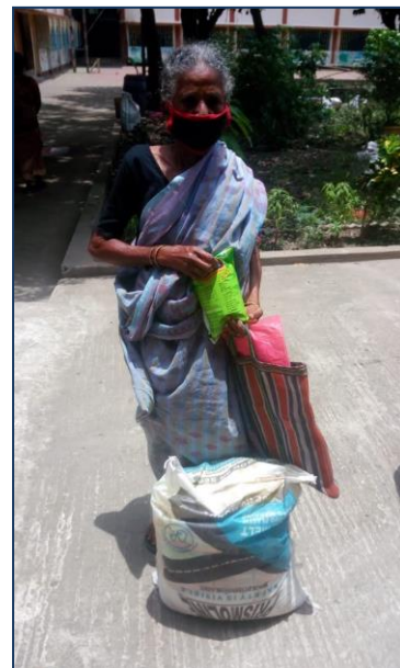
Above: Food distribution for slum families in DBA's main campus