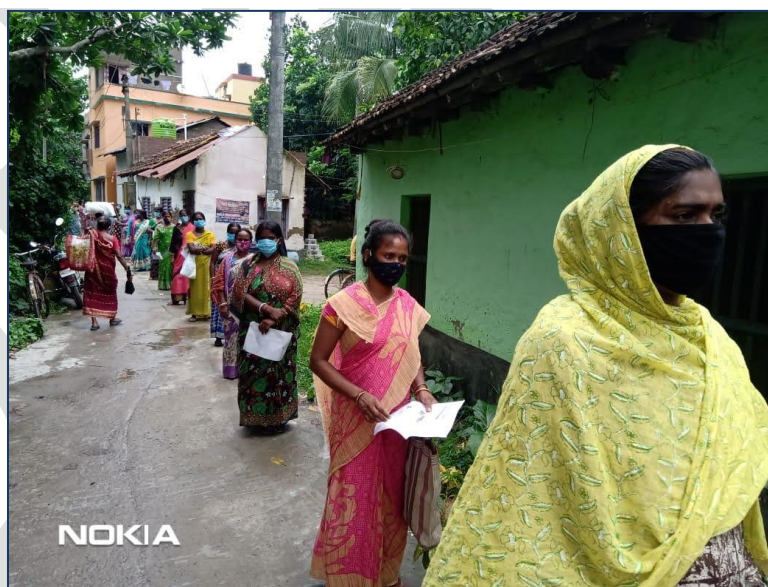
Below: People queue up for food rations at our non-formal education centre in Bahir Gangarampur