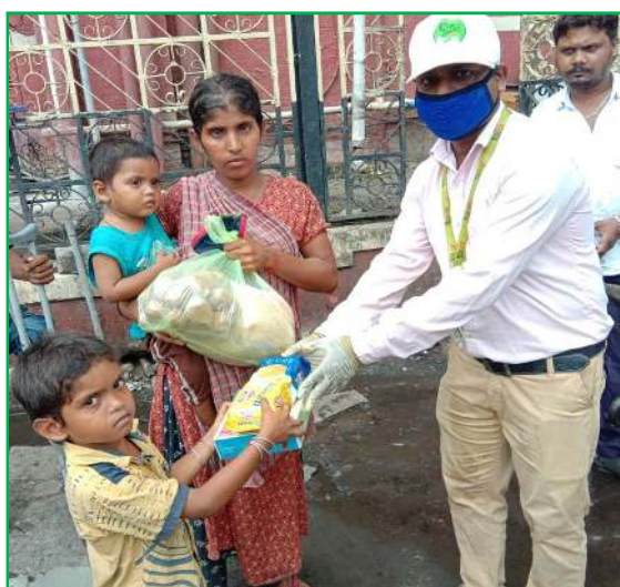
Baby food for infants and food rations for families in Howrah Station

During the lockdown our staff were working from home or directly going to activity point; preventing child marriage, child rescue etc With the relaxation in lockdown norms from 1 June 2020, our staff members are on duty with a third of the staff being present on any given day.