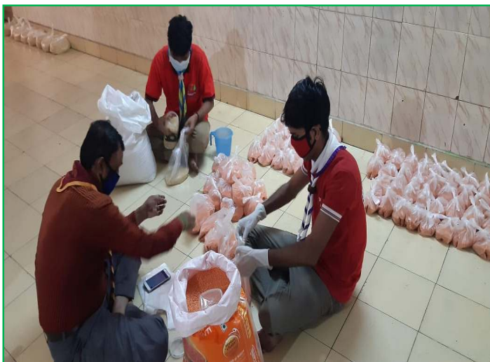
Food packets being prepared prior to distribution

200 children in Kalyani were given cooked food consisting of rice, dal, vegetable, chicken curry and papad. Another 60 children are being served cooked food in Bhattanagar 4 times a week. These children are from families who have lost their livelihoods and have not received any assistance from the Government. We are trying to link them with other organizations so that they get food for the other three days. In Howrah Station 22 families having infants were given baby food in addition to the food rations for each family. Social distancing norms were strictly maintained during the distribution programs our staff members with the help of the police ensured that there was no crowding at any point and people stood in the queue two meters apart from each other. Each recipient in the queue was given a coupon and he/she stepped up to the counter only when their coupon number was called out.