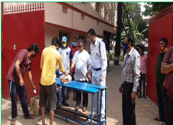
Police assist our staff in the food distribution program