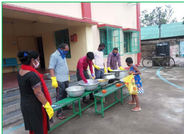
Cooked food being distributed to children in Bhattanagar