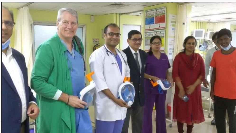
Left: Masks being made in Kalyani Vocational Training Centre