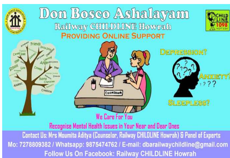
Online counseling support poster in Howrah station and other locations across the city