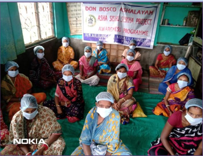
Awareness programs in ASSP's Bahirgangarampur and Premchand Centres