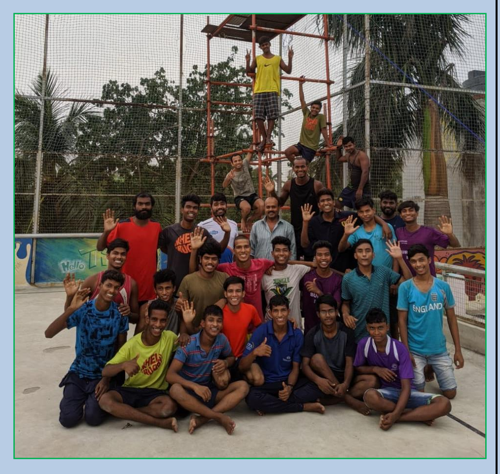
Boys in DBA's Asha Tici Hostel in Bakrahat. 24 boys from this hostel took admission in Class XI & XII

Finally the Government has given permission to schools and colleges to go ahead with the admission process. Our boys and girls are busy with the admission process. They have chosen their respective subjects and have applied for admissions in Class XI & XII. Looks like the classes will be online atleast for the first few months before moving into regular classroom mode. We wish them all the best in their chosen streams. 19 and girls took bovs admission in Class XI and 21 in Class XII.