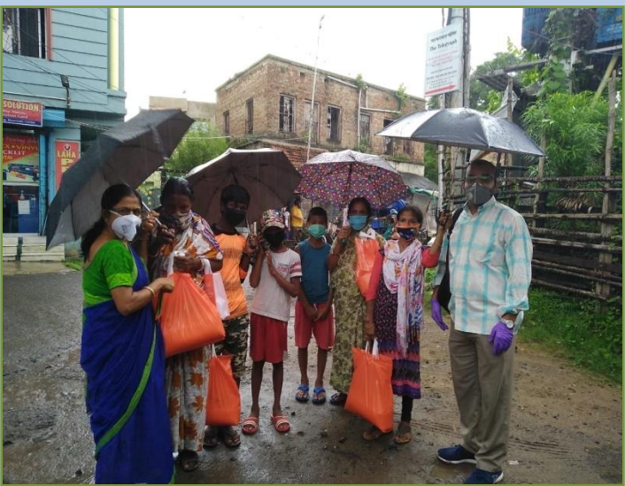
Food rations and financial support to our children & families in various locations in Howrah, Kolkata, South 24 Parganas and North 24 Parganas District of West Bengal