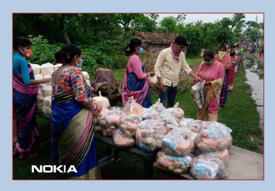
Food distribution in ASSP's Sijberia Centre

We are using all possible means to protect our children currently staying with their parents. We are in touch with all of them on a weekly basis except for the few who cannot be easily reached over phone. Children staying with us are staying within the premises and are under the care of the Father's, Sister's and Residential Staff. A select few staff members come to work for 2 to 3 days a week. Their temperature is checked at the gate by the security guard and then they have to sanitise their hands before entering their respective offices. Visitors unless for a specific purpose like repairs etc., are totally barred from entering the campus and even they are restricted to the area of work and cannot interact with children.